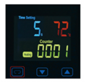
Press SET button after setting