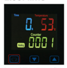
Press SET button after setting temp