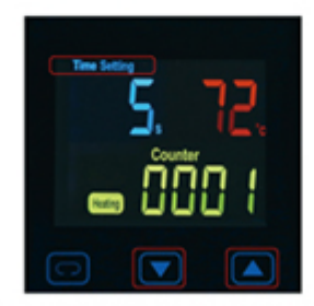
Press arrows " \triangle "or" \nabla "adjust temp you need