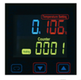
Press arrows " \triangle "or" \nabla "adjust temp you need