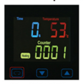
Press STE button