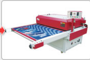
2. Heat Press Transfer