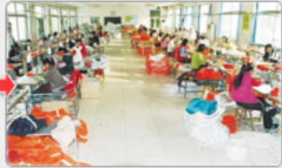
3. Specail Sewing Workshop