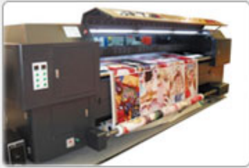
1. Large Format Printing