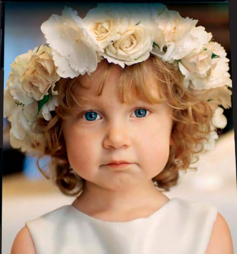
Epson Stylus Pro 3800