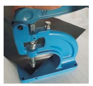
Step 5: Holding the handle at that level, align the material into position Step 6: Using both hands, completely depress the handle. to set the grommet.