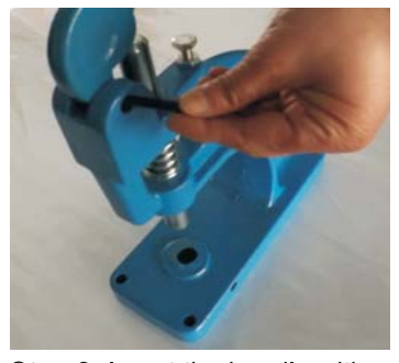
Step 2: Insert the handle with the larger side at the top of the machine