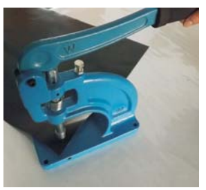
Step 4: Depress the handle lightly until the top die is touching the washer.