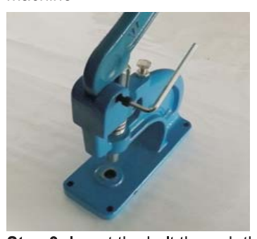
Step 3: Insert the bolt through the machine and handle, then tighten the bolt with the nut.