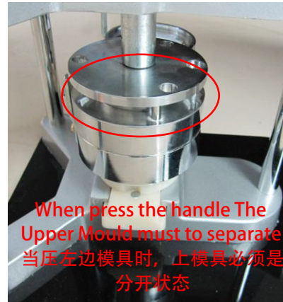
When press the handle The Upper Mould must to separate 当压左边模具时，上模具必须是 分开状态

C. Hold the badge machine and press the handle