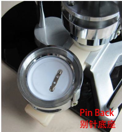
Pin Back 别针底座

A. Put the Upper shell ,printed paper and mylar disk in order in the left mould