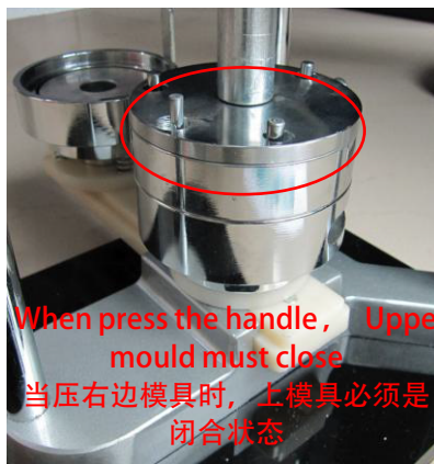
When press the handle , Upper mould must close 当压右边模具时，上模具必须是 闭合状态

C. Hold the badge machine and press the handle