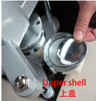
Upper shell 上盖