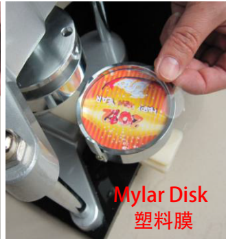
Mylar Disk 塑料膜

A. Put the Upper shell ,printed paper and mylar disk in order in the left mould