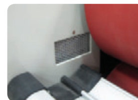
The baffle - board of photocell safety switch