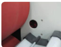
Photocell safety switch