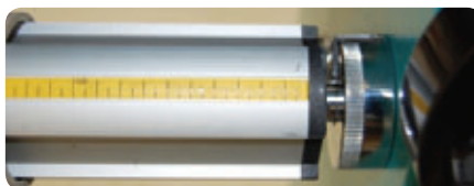
New type aluminium alloy supporting roller