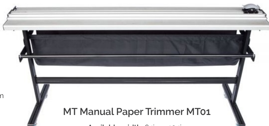
MT Manual Paper Trimmer MT01