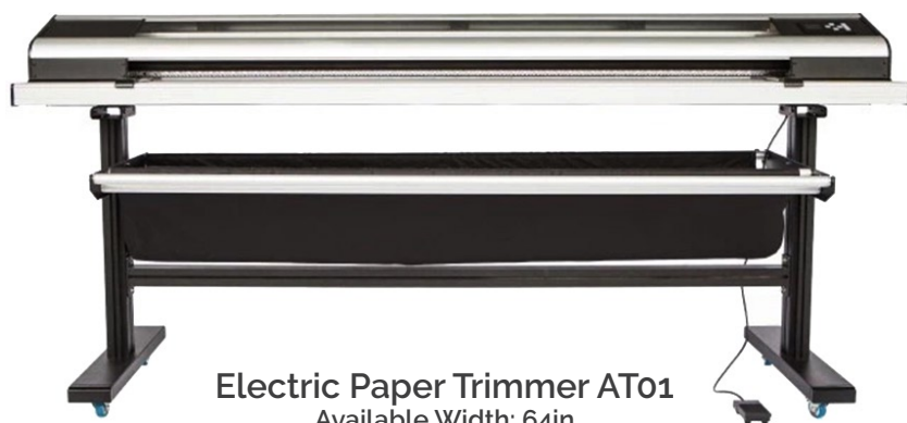
Electric Paper Trimmer AT01 Available Width: 64in

Electric paper trimmer is especially for cutting various advertising coiled materials, contributes to graphic post progressing. Especially for cutting various advertising paper, pvc, film, wallpaper, transfer paper, car sticker, adhesive sticker, PVC, PP, etc. Large format working width, Adjustable cutting speed and length. Bi-directional self-sharpening rotary blade with imported tool steel, strong and durable. Cutting switch by hand or by foot pedal is optional. Big waste catcher keep your work place tidy.