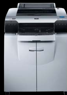
Epson Stylus Pro 4880 (Shown with optional printer stand)