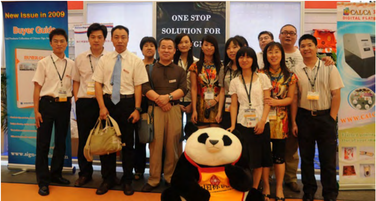
ChinaSigns staff Shanghai 2009

Now, nine months later, I have returned to China to evaluate the company as a first step towards evaluating the products they offer